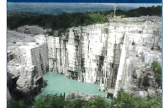
Rock of Ages Granite Quarry