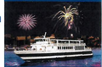
Dinner Cruise on beautiful Lake Champlain