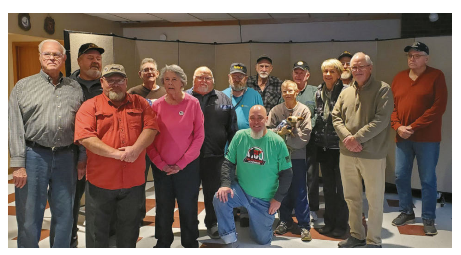
We celebrated Veterans Day on Friday, November 11th with a free lunch for all vets and their spouses. We appreciate their service and are grateful they are part of our community.